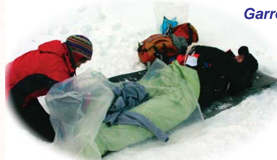
Students practice advanced first aid skills as they become certified as Wilderness First Responders.

A comprehensive educational program that prepares you for job opportunities ranging from instructing to managing businesses to therapeutic applications of adventure sports.