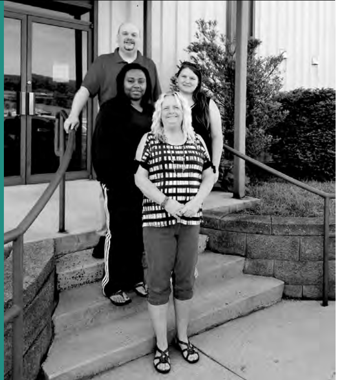
Most Recent Human Services Associate (H.S.A) Class

Each module culminates in a credential and/or certification. While most students will enroll in the program with a goal of employment, those already working in the field may benefit from individual courses as professional development.