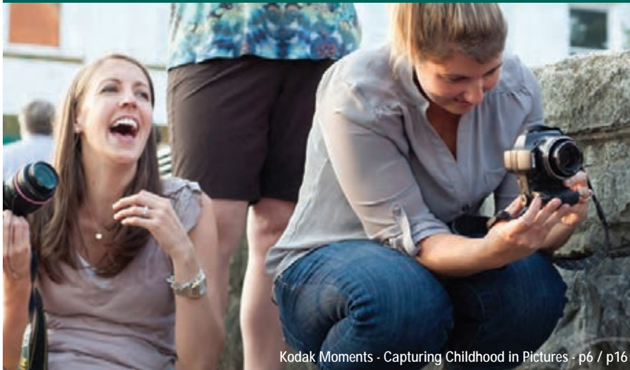
Kodak Moments - Capturing Childhood in Pictures - p6 / p16