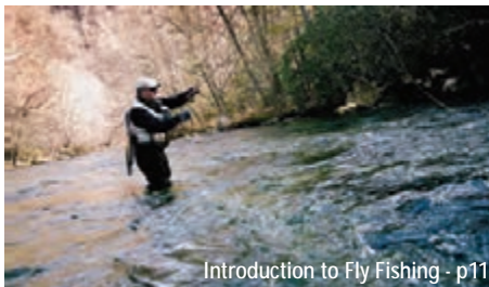
Introduction to Fly Fishing - p11

GARRETT COLLEGE CONTINUING EDUCATION & WORKFORCE DEVELOPMENT