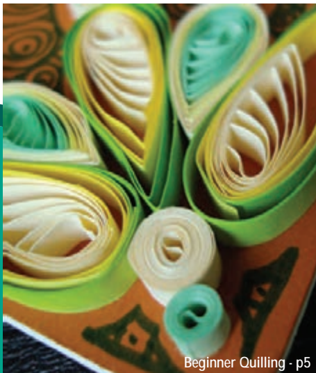
Beginner Quilling - p5