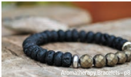
Aromatherapy Bracelets - p8