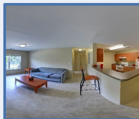
Apartment kitchen and living area