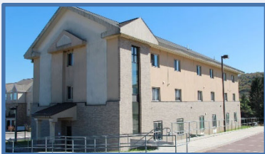
Garrett Hall traditional residence hall

Housing contract for Garrett Hall is for two semesters and includes your choice of required Laker Dollars.