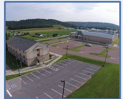
Garrett Hall proximity to CARC