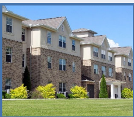
Laker Hall apartment style hall

Laker Dollars are not required; however, they can be added for an additional fee.